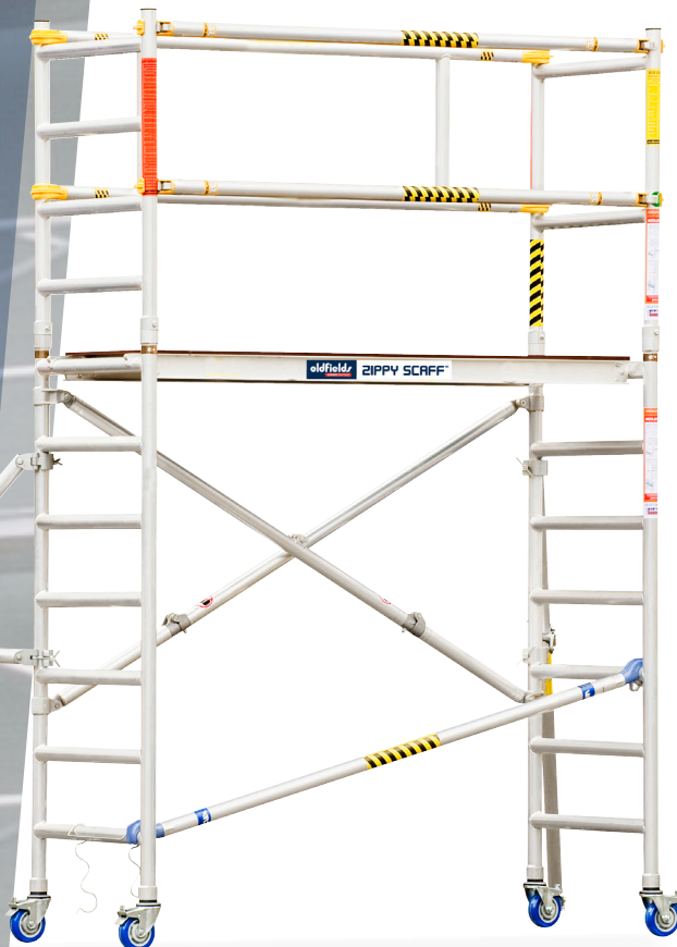
BASE UNIT + GUARDRAIL EXTENSION PACK

Extension pack with Outriggers required as per AS/NZS 1576