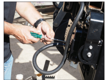
Connect LED lights and you are ready for action

*IWE full replacement instructions will be provided.