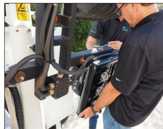
Fit new LED Lights