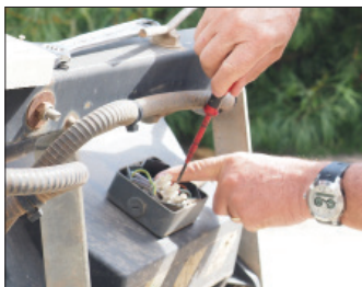
Disconnect and remove the old metal halide lights