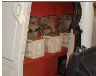
Disconnect and bypss ballast